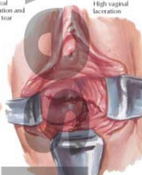
High vaginal laceration