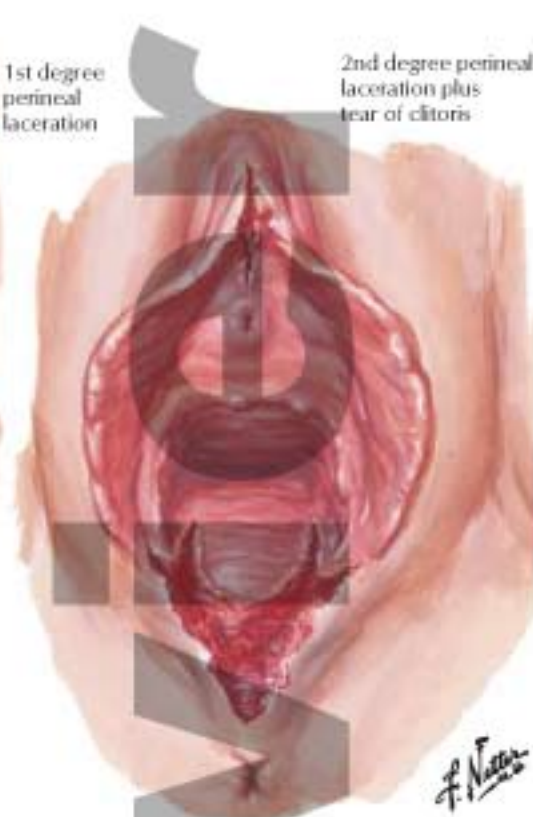
2nd degree perineal laceration plus tear of clitoris