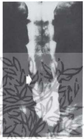
Myelogram (AP view) showing prominent extradural defect (open arrow) at C6-7