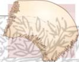
Flat bone (parietal)