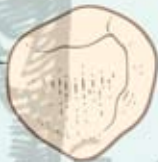
Sesamoid bone (patella)