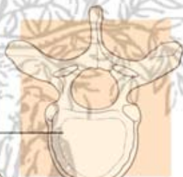
Irregular bone (vertebra)