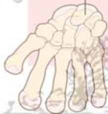
Short bones (carpals)