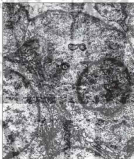
Electron photomicrograph. Type II pneumocyte practically devoid of lamellar bodies.