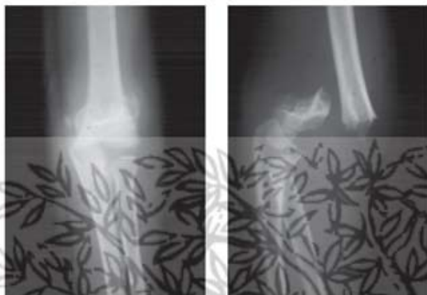
Anteroposterior (left) and lateral (right) radiographs. Displaced supracondylar fracture.

Injury to brachial artery and median nerve by fracture may lead to Volkmann contracture