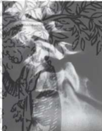
Lateral radiograph shows severe kyphotic angulation in cervical dislocation