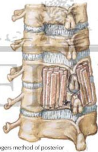
Rogers method of posterior fusion. Wire wrapped around spinous processes plus fusion of vertebrae.