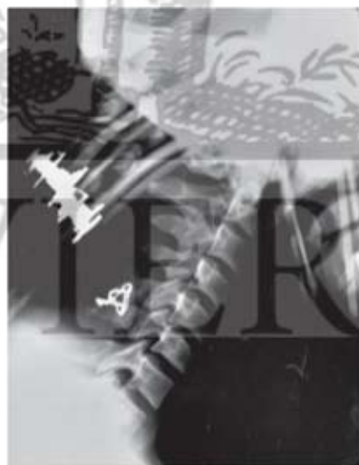
Postoperative radiograph shows corrected alignment and fixation wire in place