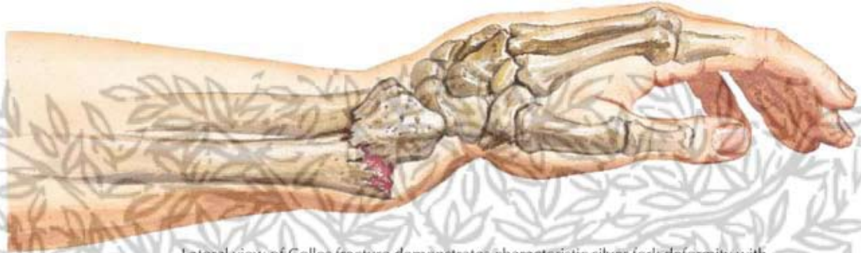
Lateral view of Colles fracture demonstrates characteristic silver fork deformity with dorsal and proximal displacement of distal fragment. Note dorsal instead of normal volar slope of articular surface of distal radius