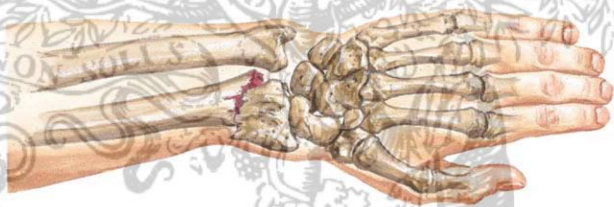
Dorsal view shows radial deviation of hand with ulnar prominence of styloid process of ulna and decrease or reverse of normal radial slope of articular surface of distal radius