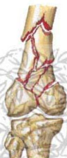
Comminuted fracture extending into shaft