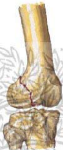
Fracture of single condyle (frontal or oblique plane)