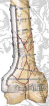
Compression screw and plate preferred for some fractures