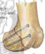
Fracture of single condyle reduced and fixed with screws