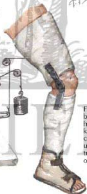
Fracture brace hinged at knee and cast shoe used after traction or open repair